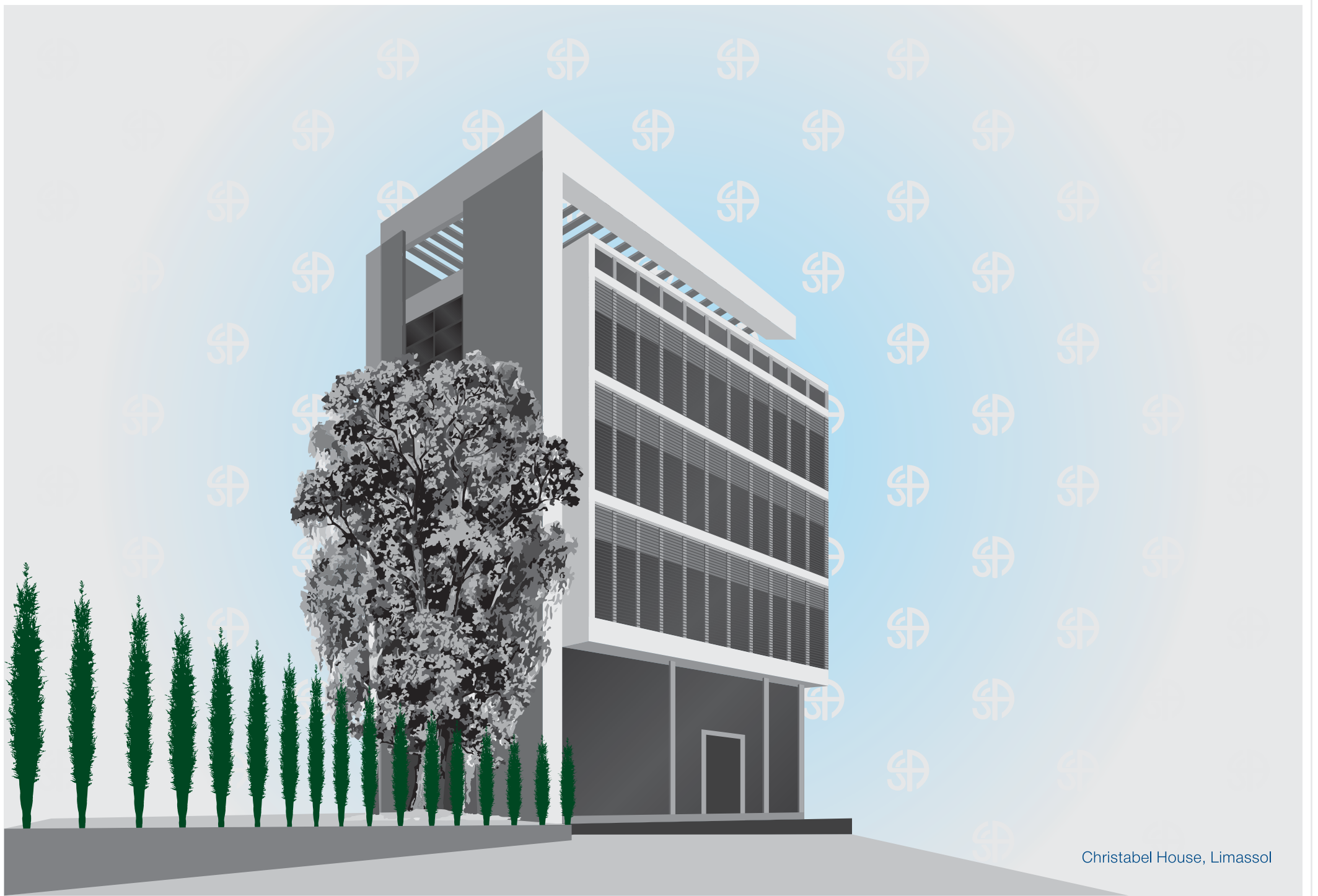
Christabel House, Limassol